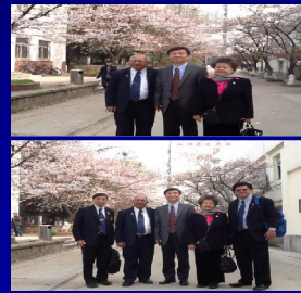
March 21-24 ,2013