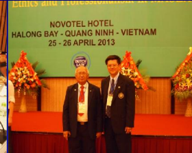
Halong: April 25-26,2013