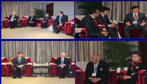
Jan 26-28 ,2013