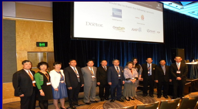
May 24-26 ,2013