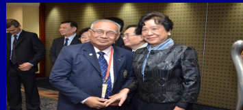
Macau: November 8-10 ,2012